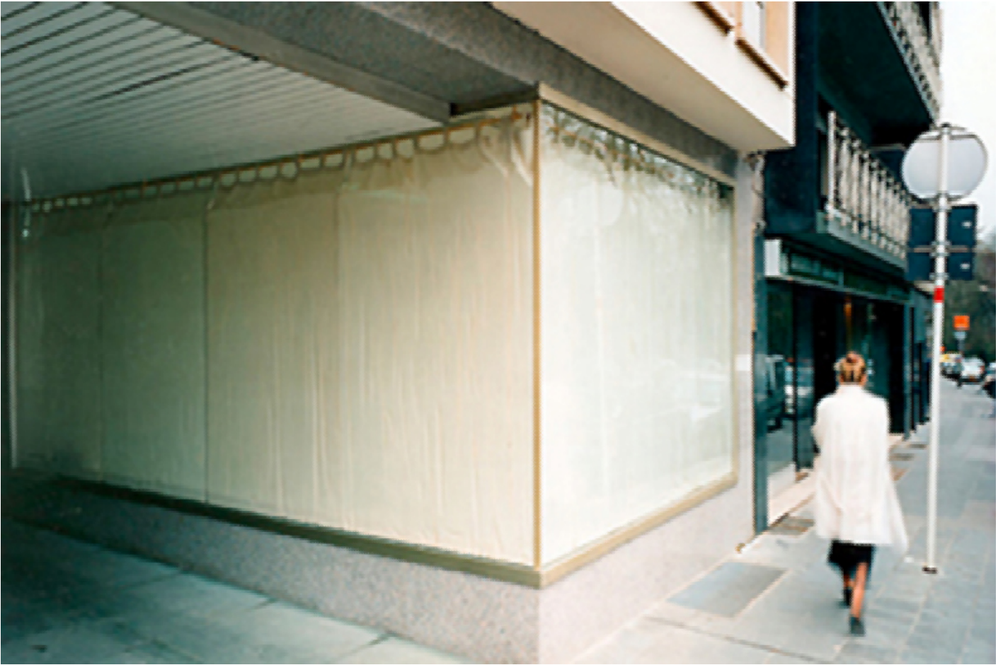
SCHAUFENSTER (Show Case), 1995 Curtain (cotton, trimmings), wallpaper paste Exhibition at Galerie Erna Hécey, Luxembourg

A cotton curtain is being stuck to a shop window using wallpaper paste. The outside world is barely visible when viewed from inside.