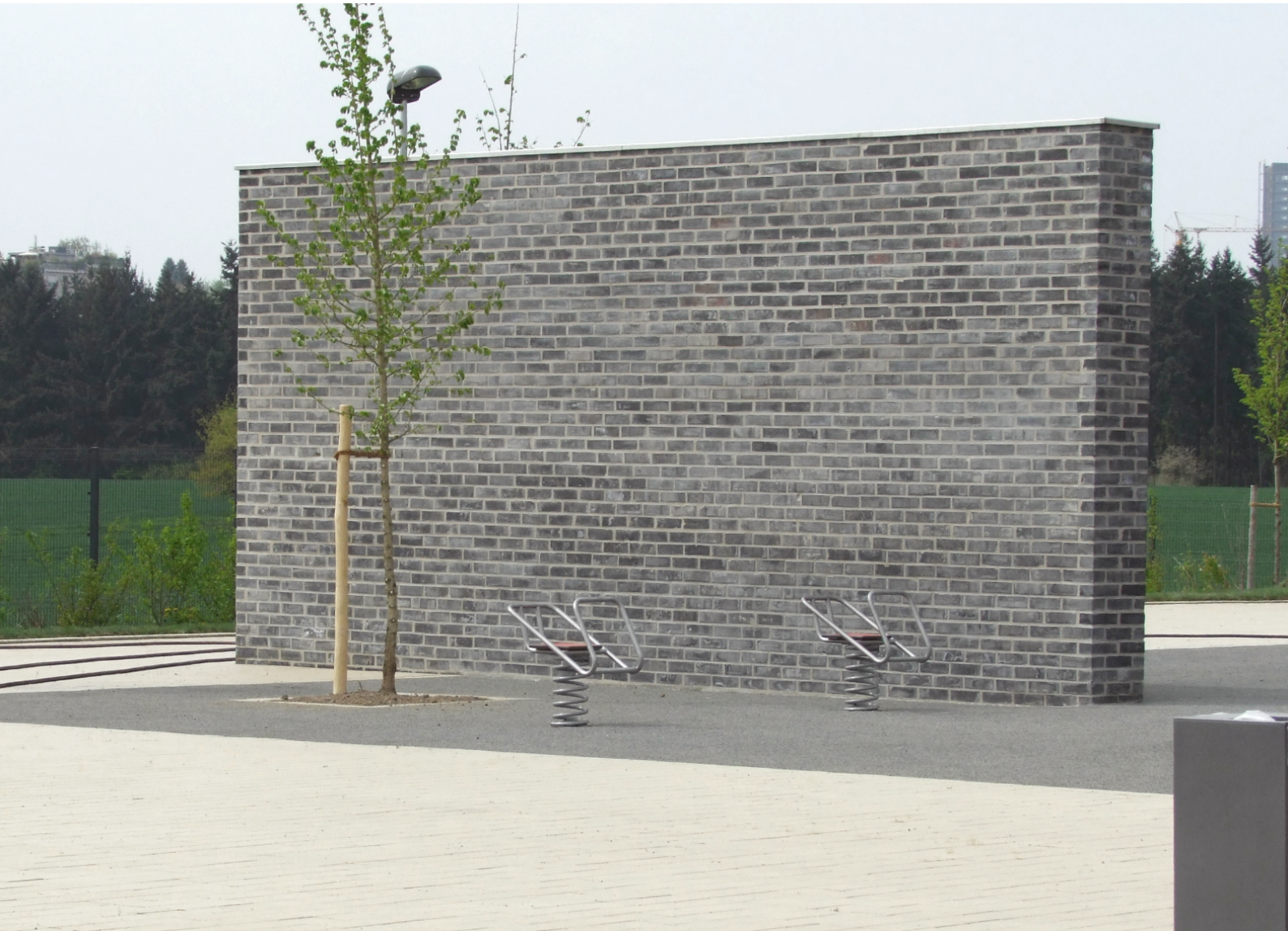
WAND (Wall), 2006 Work in public space, Primary School Campus, Luxembourg-Hamm