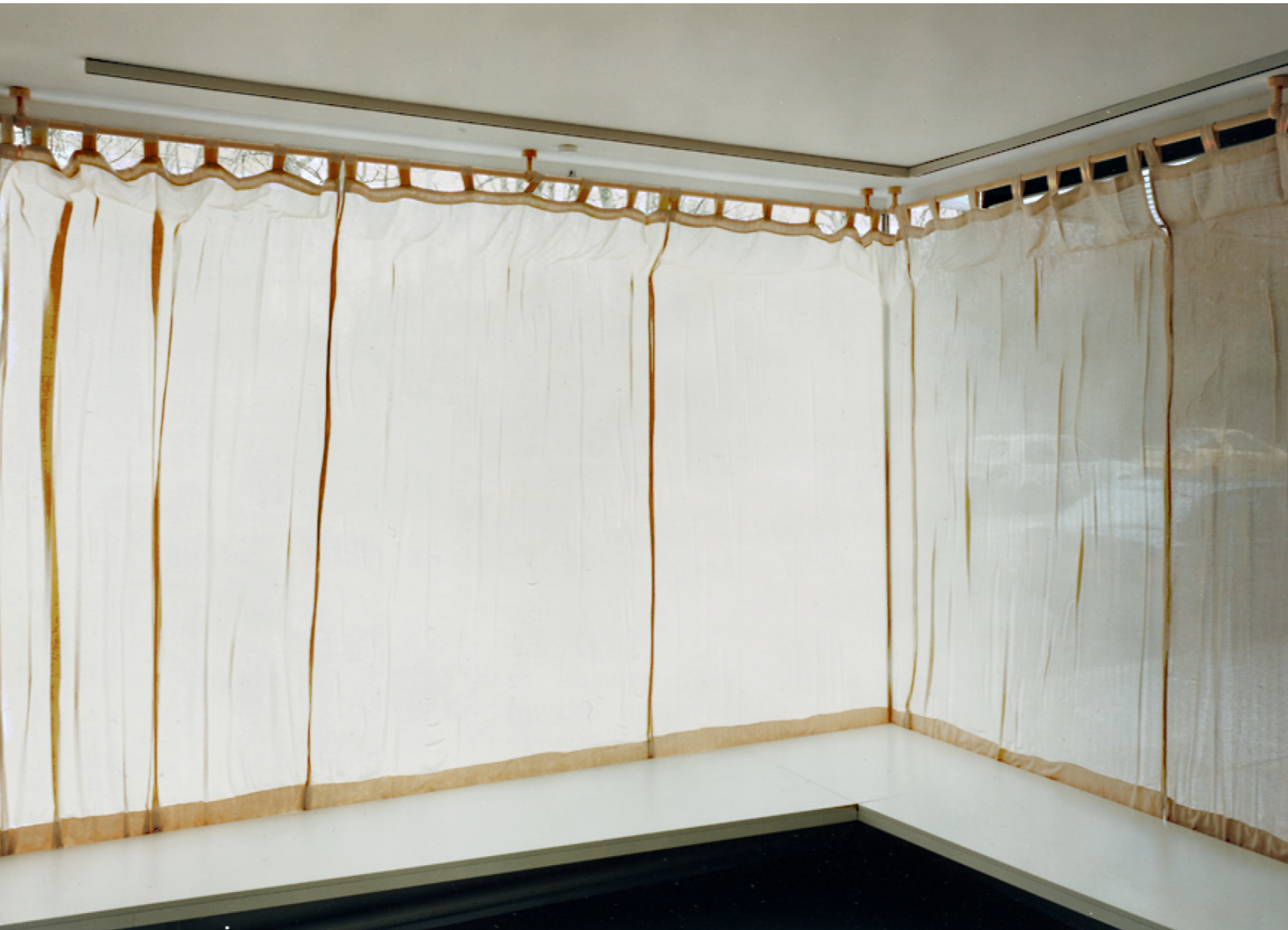
SCHAUFENSTER (Show Case), 1995 Curtain (cotton, trimmings), wallpaper paste Exhibition at Galerie Erna Hécey, Luxembourg

A cotton curtain is being stuck to a shop window using wallpaper paste. The outside world is barely visible when viewed from inside.