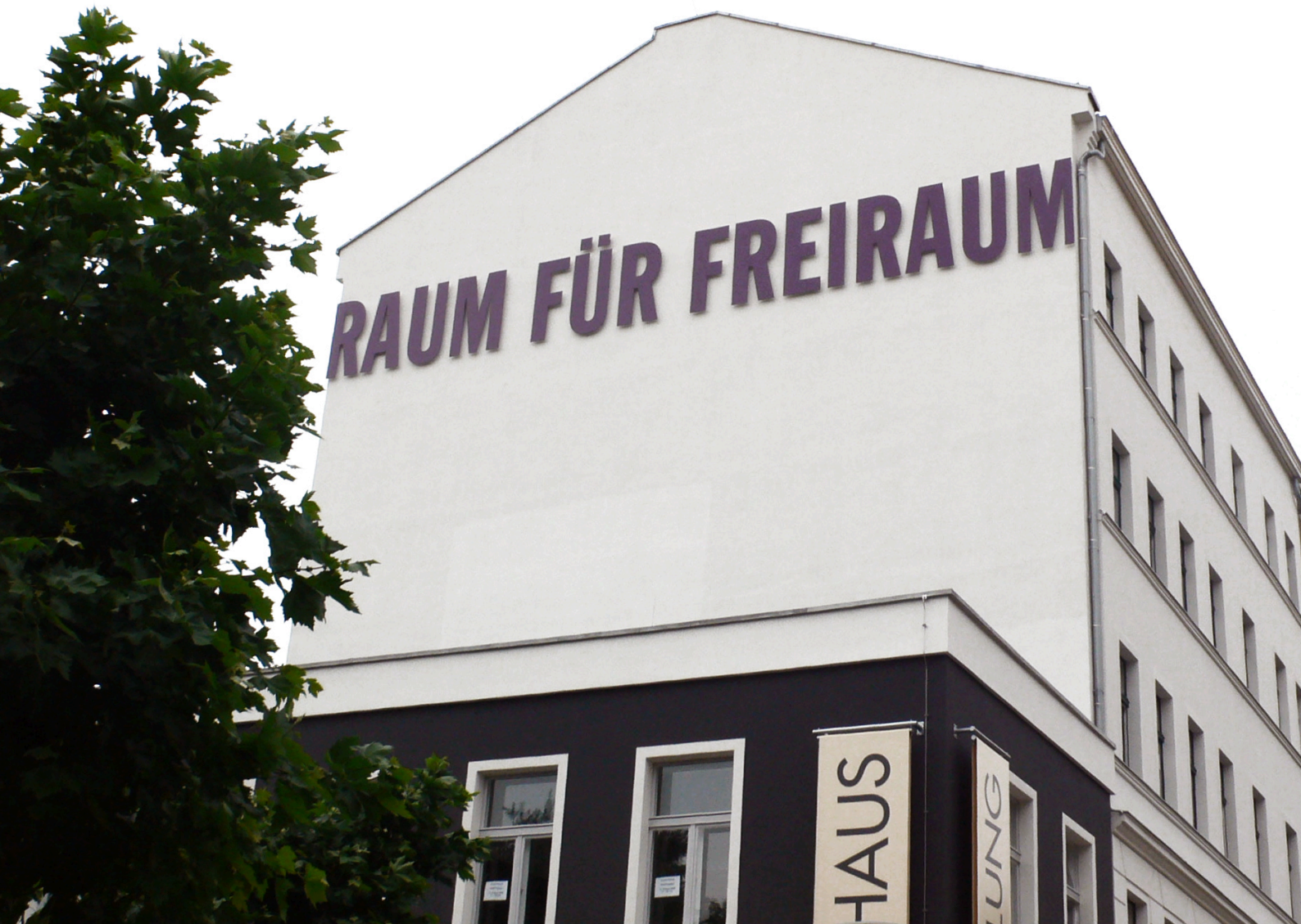
RAUM FÜR FREIRAUM (Space for open space) 2005 Installation at the Lichtenberg City Museum, Berlin