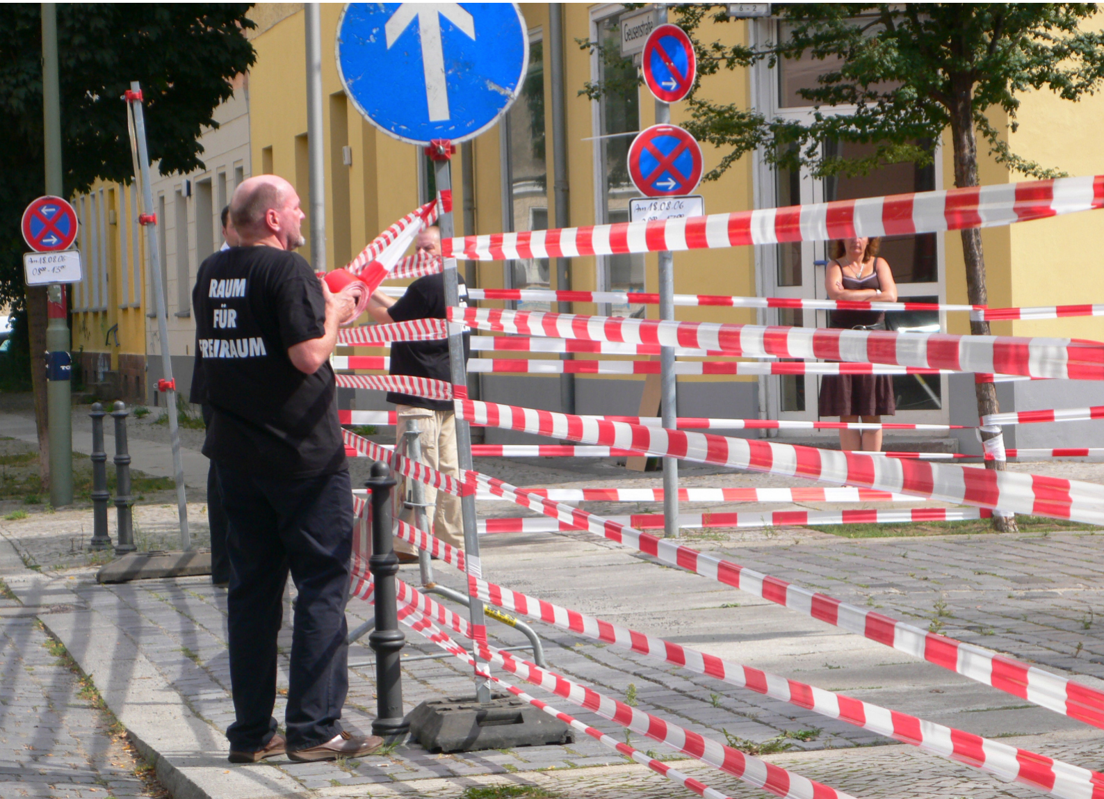
TUCHOLLA PLATZ, 2006, Barrier tape Installation in public space, Tuchollaplatz Berlin