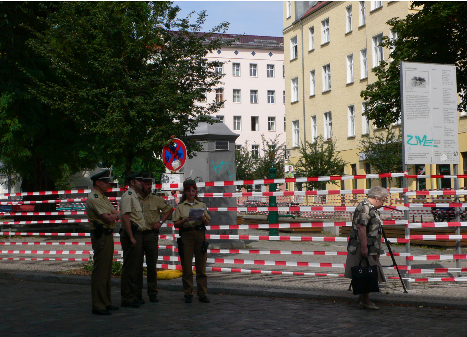
TUCHOLLA PLATZ, 2006, Barrier tape Installation in public space, Tuchollaplatz Berlin