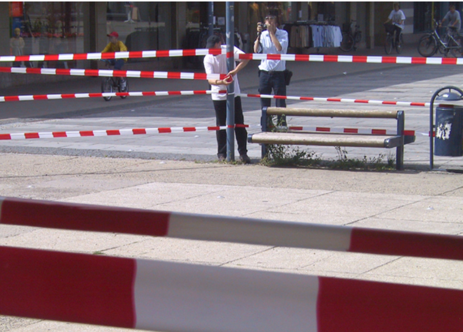
PLATZ DA, 2003, Barrier tape Exhibition superUmbau , Hoyerswerda. Curated by Ute Müller-Tischler